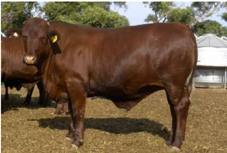
Left: A Riverslea Best Beef Bullock - 100 days on feed.