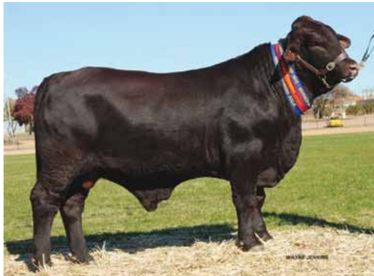
Above: Riverslea Deputy - the Champion Junior Bull at National Beef 2010. He created a lot of interest for the stud due in part to his exceptionally dark colour. The bull was sold to Southern Star Santa Gertrudis Stud.