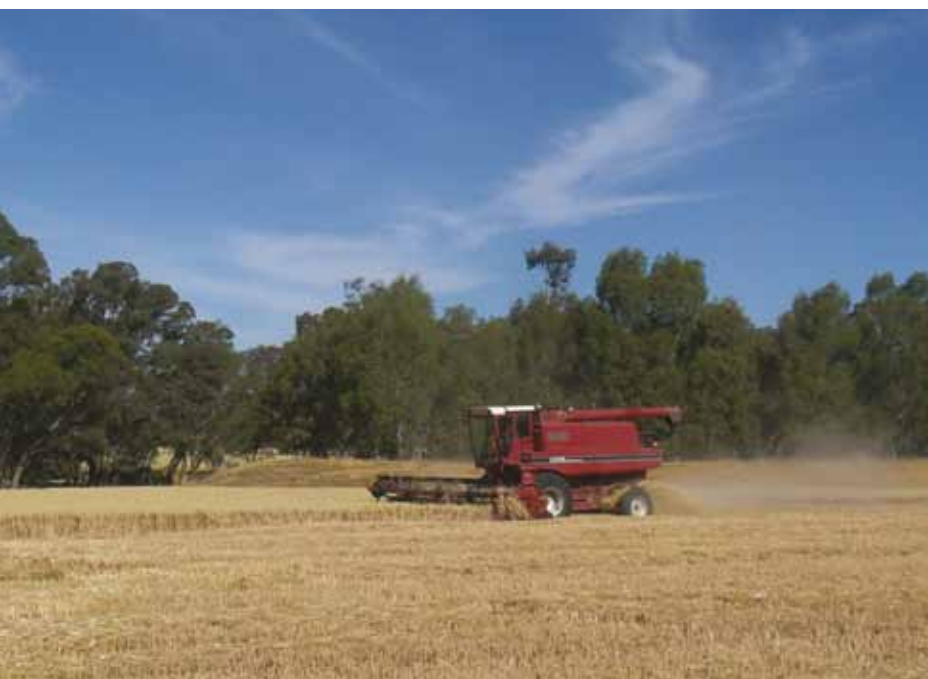
Below: In excess of 2000 tonnes of silage and hay will be produced on-farm this year.

“As seed stock producers we are committed to breeding commercially relevant bulls that will produce progeny that meet the specifications that improve the bottom line.”