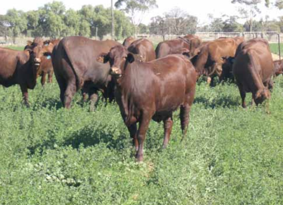
Top: Santa Gertrudis Cattle – with their resistance to bloat - are the perfect fit with lucerne based irrigated pastures. Above: Alan, Sonia & Russell Gray with a pen of steers at a recent Riverslea on farm field day. Below: Harvesting the corner paddock.