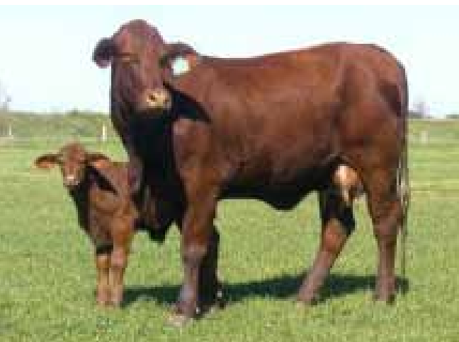
Above: Riverslea Bella (P) – One of the first S- heifers from the grading up program.

The Riverslea brand epitomizes the Martin's attitude to the stud and farming. It is clear, uncomplicated, and distinctive. The brand represents the cycles of life; the cycles of nature. The arrow represents the direction the business is heading and it's anticlockwise because "we need to create our own destiny, take our own path and mostly that is taking the path less travelled."