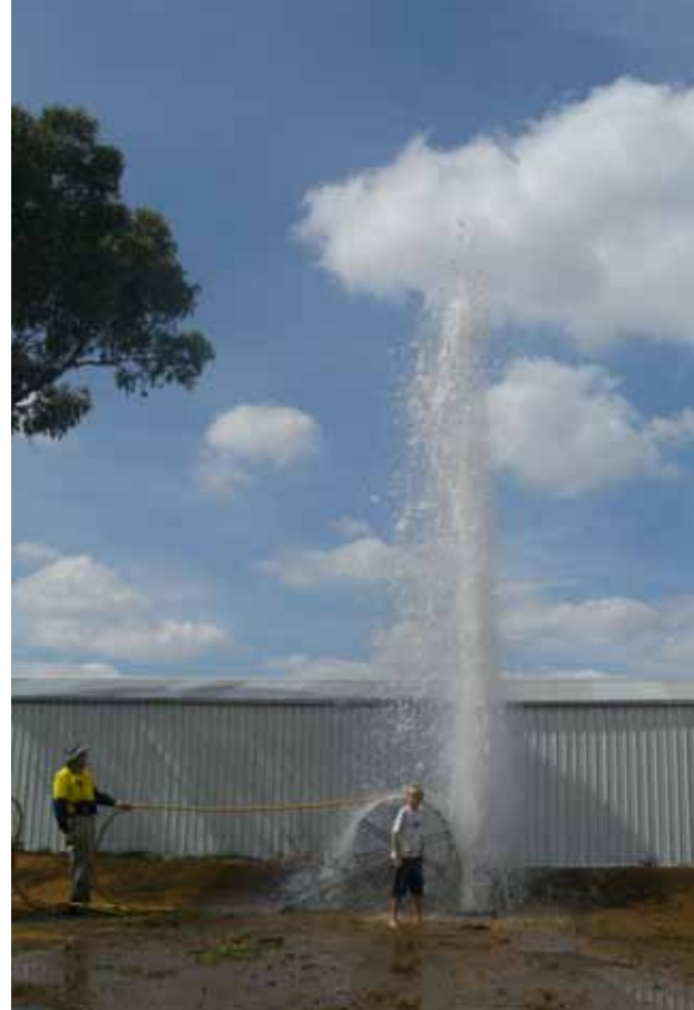
Above: Water – the life blood of farming. New bore at Riverslea.

“As seed stock producers we are committed to breeding commercially relevant bulls that will produce progeny that meet the specifications that improve the bottom line.”