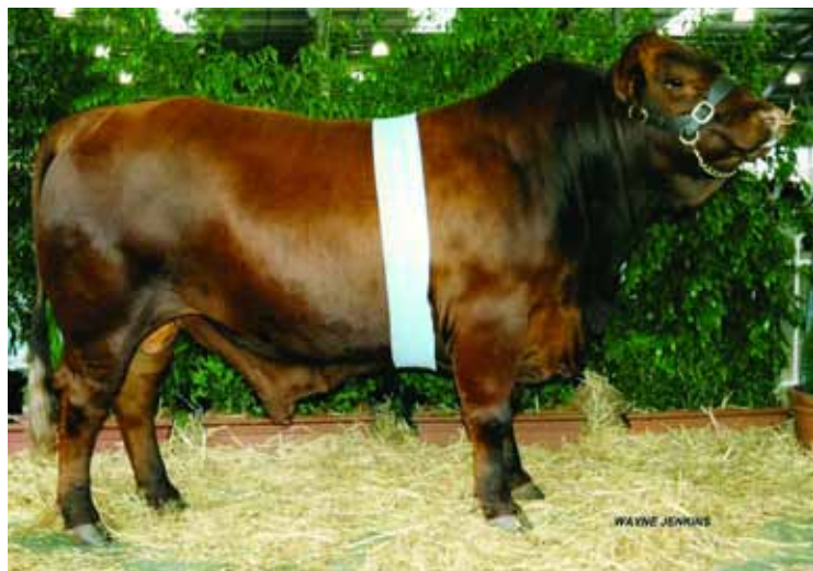
Bottom: Riverslea Digger - a two time winner of the Hunter Trophy Award (2009 and 2010) and the Santa Gertrudis Association President's Trophy in 2009. His first sons are on the ground now.